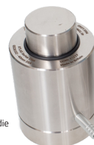
40 mm die