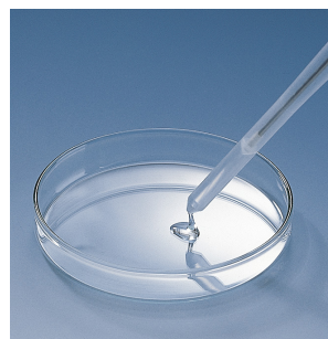
Highly viscous media