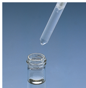
Media with high vapor pressure