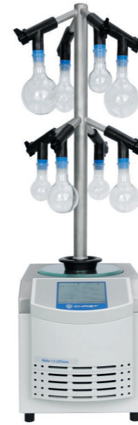
Alpha 1-2 LSCbasic