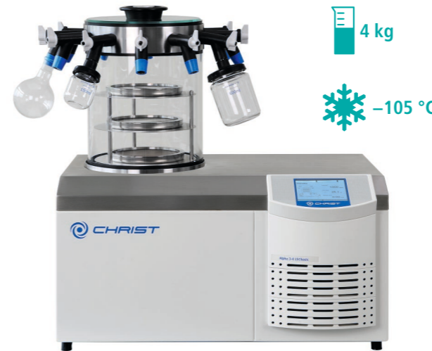
Alpha 3-4 LSCbasic