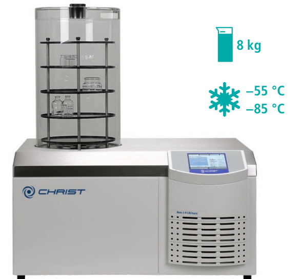
Beta 1-8 LSCbasic Beta 2-8 LSCbasic