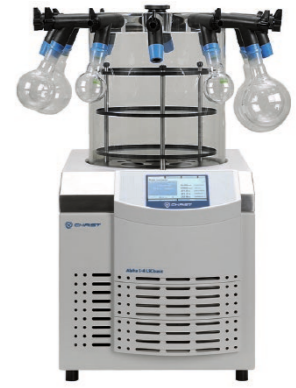
Alpha 1-4 LSCbasic Alpha 2-4 LSCbasic