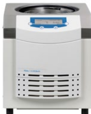
Alpha 1-2 LDplus