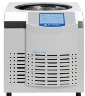
Alpha 2-4 LSCbasic