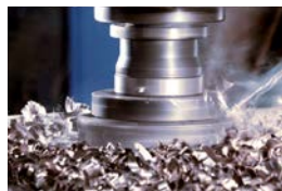
Metal processing industry