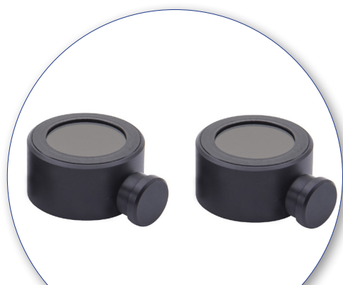
CL-17.1: Additional polarizing filters for CL-11.1