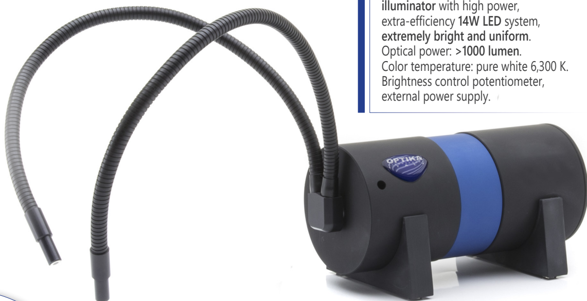
CLD-01 with CL-11.1

Flexible and professional cold light illuminator with high power, extra-efficiency 14W LED system, extremely bright and uniform. Optical power: >1000 lumen. Color temperature: pure white 6,300 K. Brightness control potentiometer, external power supply.