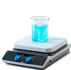
AREC 10 Digital