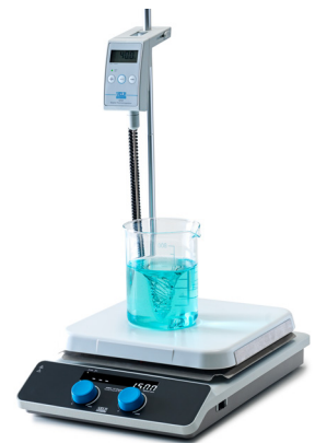
AREC 10 Digital System with VTF and Rod