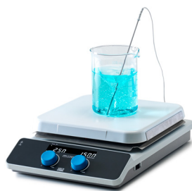
AREC 10 Digital System with Probe