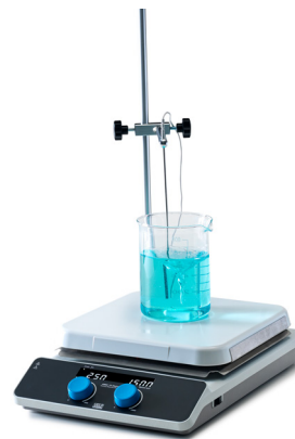
AREC 10 Digital System with Probe, Rod and Clamp