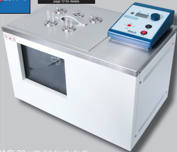
WVB-30 with lid (included) and viscometer holder WVB02010 (optional)