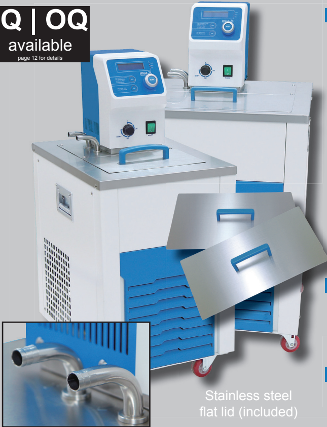
Stainless steel flat lid (included)

Connection for external circulation Ø12.5mm