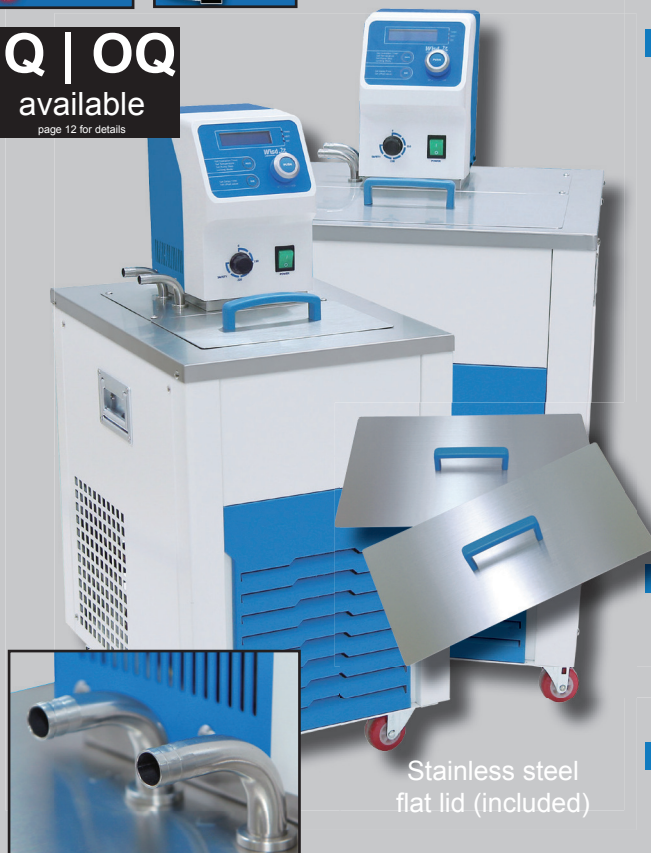
Stainless steel flat lid (included)

Connection for external circulation Ø12.5mm