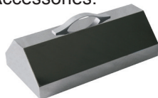
Dome lid for shaking water bath WSB