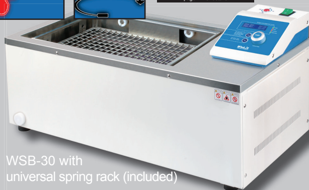
WSB-30 with universal spring rack (included)